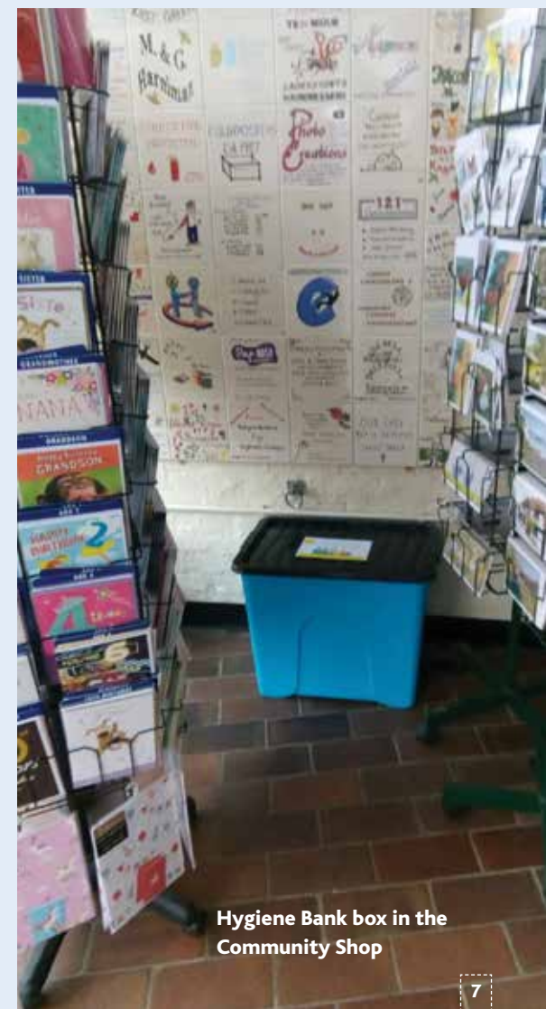
Hygiene Bank box in the Community Shop